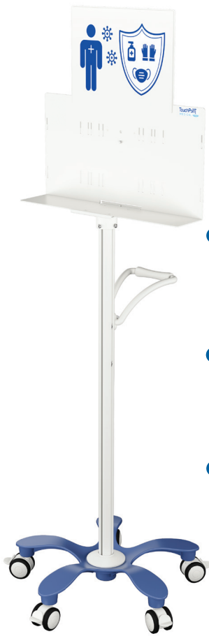
Main Back Board Fastened to Device Mount Roll Stand 119-002210-0